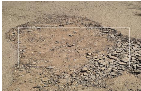
Fig.1. Live webcam-based pothole detection interface

Figure 1 illustrates the live webcam-based pothole detection interface developed for the proposed system. The interface continuously captures road surface frames and processes them using the trained YOLO detection model. Detected potholes are highlighted using bounding boxes along with classification labels and confidence scores. This real-time visualization enables the system to detect road surface defects immediately as they appear within the camera frame, making it suitable for continuous road infrastructure monitoring.. Real-Time Monitoring Dashboard