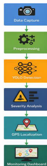
Fig. X. System architecture for real-time pothole detection system and monitoring

The workflow includes capturing road images, preprocessing data, detecting potholes using YOLO, estimating severity, and recording location data. The final results are displayed through a monitoring interface for efficient road condition analysis and maintenance planning.